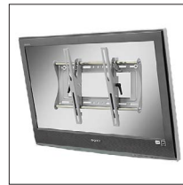
TV/Monitor Mounts Bretford