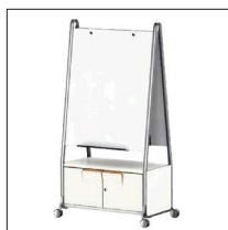
Teneo Herman Miller