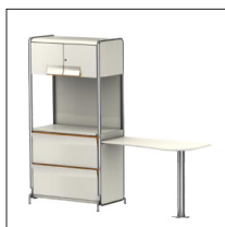
Teneo Herman Miller