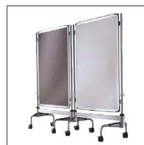
Here Mobile Boards Bretford