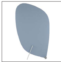
Liquid Privacy Screens Bretford