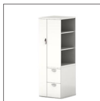
Tu ™ Herman Miller