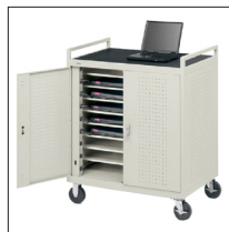
Notebook Carts Bretford