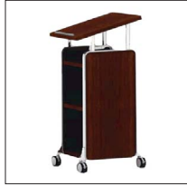
Teneo Herman Miller