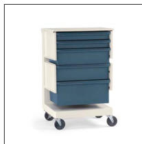
Co/Struc ® L Cart Herman Miller