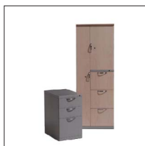
Meridian ® Herman Miller