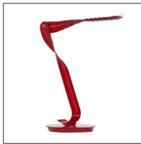
Lighting Herman Miller