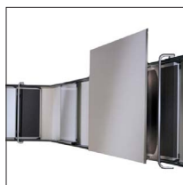
Here Rail System Bretford