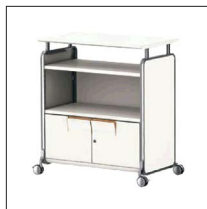
Teneo ® Herman Miller