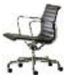
Eames Aluminum Group Management Chair

This device was their version of a curing oven. It let them create their own plywood and give it shape by using a bicycle pump to inflate a rubber membrane that pushed glued plies of wood against a curved, electrically heated plaster mold. The humble machine eventually allowed the Eameses to manufacture their molded plywood chair, named the Best Design of the 20th Century by Time magazine.