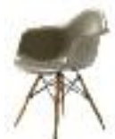
Sparrow Dowel Chair