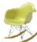
Eames Molded Plastic Armchair with Rocker Base