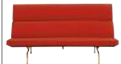
Eames Sofa Compact

The products above are among the original modern classics still manufactured today and available through Herman Miller.