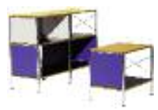
Eames Storage Units

The products above are among the original modern classics still manufactured today and available through Herman Miller.