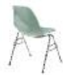
Eames Molded Plastic Side Chair

The products above are among the original modern classics still manufactured today and available through Herman Miller.