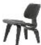
Eames Molded Plywood Lounge Chair