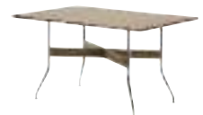
Nelson Swag Leg Table

The products above are among the original modern classics still manufactured today and available through Herman Miller.