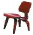
Eames Molded Plywood Lounge Chair