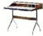
Nelson™ Swag Leg Desk