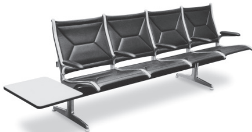
seating with attached table