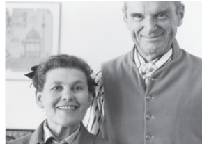
Designers: Charles and Ray Eames