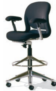
Equa 2 Stool

The one-piece Equa shell is composed of a strong yet flexible plastic permeated with color to reduce fading and make minor scratches unnoticeable. Equa 2 components are composed primarily of recycled materials.