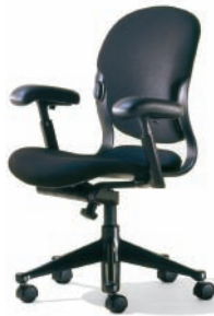
Equa 2 Work Chair