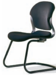
Equa 2 Side Chair