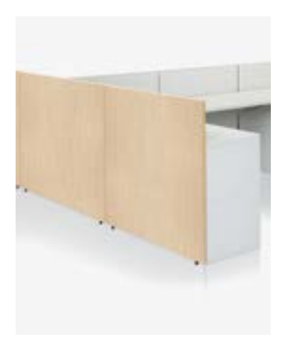
Choose among a diverse array of color and finish options to customize Ethospace for your unique aesthetic.