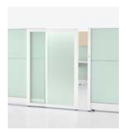
Sliding privacy doors allow individuals to fully enclose their workspaces when focus and quiet are required.

Workspaces, benching, collaborative spaces, private spaces, and meeting areas—Ethospace supports them all with beauty and style, creating a workplace that reflects your organization's unique character and supports the unique activities of your people.