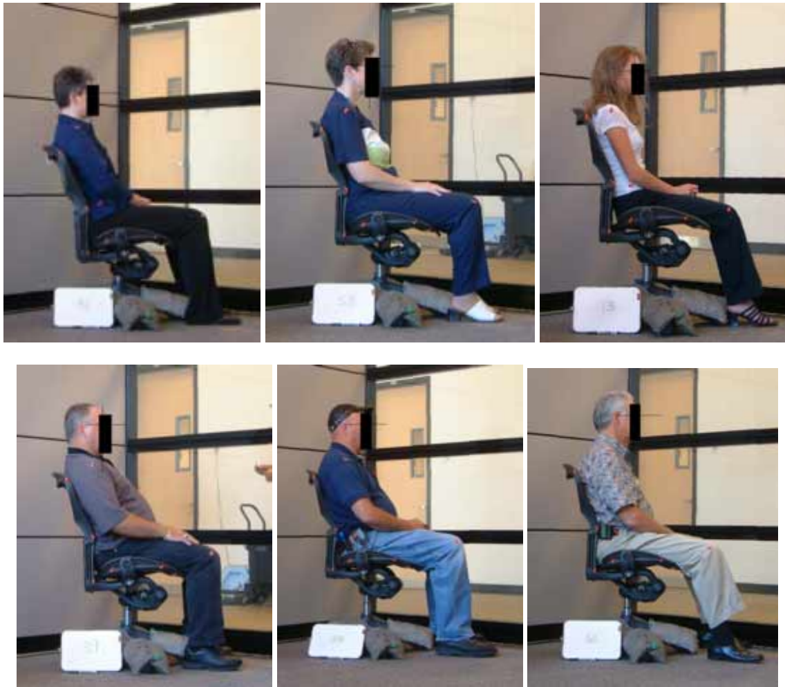
Figure 3. Postures of some of the women (top) and men (bottom) who selected preferred recline angles within 0.5 degree of the overall median.