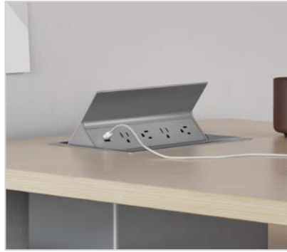
Power Access Credenza