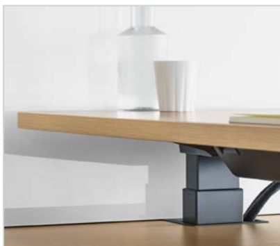
Height Adjustable Leg Integration