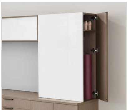
Side Facing Hutch