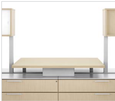
Team Bridge Surface