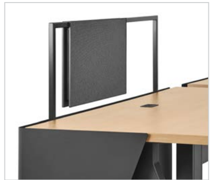
Open-Frame Screen with Movable Insert