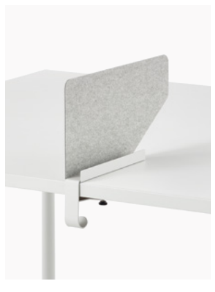
OE1 Boundary Screen