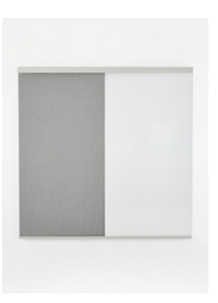
OE1 Wall Rail and Board