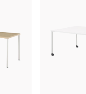
OE1 Project Table