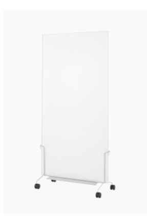
OE1 Mobile Easel