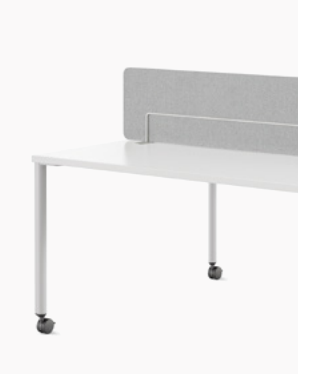
OE1 Movable Screen