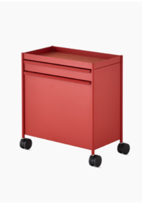
OE1 Storage Trolleys