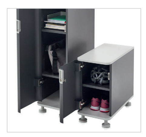
Personal storage options