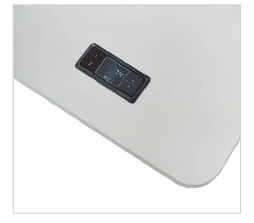
Electric height-adjustment options