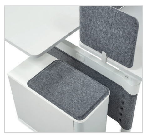
Storage with seat-pad