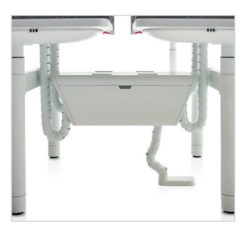
Power distribution hubs

For full features and options available for Atlas Office Landscape, please visit hermanmiller.com