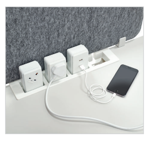
Integrated desktop power solutions