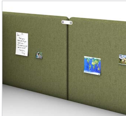
Tackable Fabric Tack on photos or reminders for an organised and personalised workspace