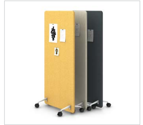
Nesting The Bound Mobile Screen is designed to nest with others for stowing within a small footprint