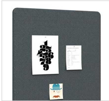
Tackable Fabric The tackable surface can help foster collaboration