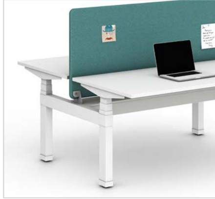
Surface- or Transom-Mounted Screens can attach to a surface or transom to delineate and provide privacy