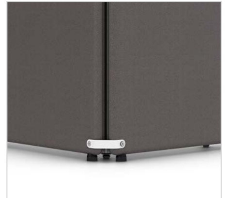
Connecting Brackets Connects multiple screens together to create spaces

For full features and options available for Bound Screens, please visit hermanmiller.com