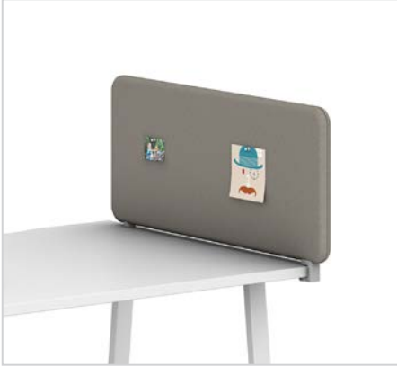
Tackable Fabric Tack on photos or reminders for an organised and personalised workspace