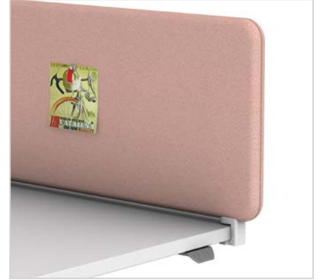
Delineation Screen Attachment Slides on like a paper clip, making it easy to attach the privacy screen to the work surface