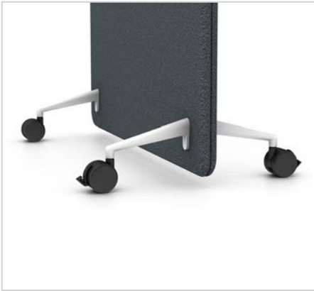
Lockable Castors The Bound Mobile Screen has castors that lock so it sets securely in place