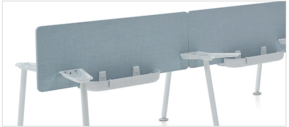
Central Spine and Wire Management

For full features and options available for Memo Desks, please visit hermanmiller.com