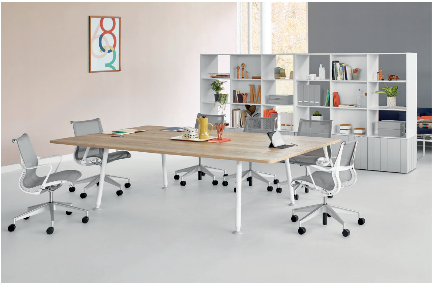
Memo includes meeting tables to bring people together to discuss their work.

Memo's simple and clean design creates functional and uncluttered workstations. Benches, integrated or free-standing meeting tables, project tables and storage units create a variety of mixed spaces. Screen heights in different styles and materials add personality. Screen-attached work tools, pin boards, whiteboards and shelves come in a wide range of finishes to add style and individuality.