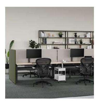
View image library