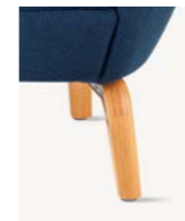
Solid Oak legs