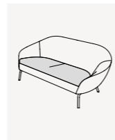
Two Tone back and arms/ seat