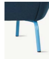
RAL powder coated legs NaughtOne Colours