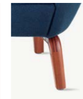
Solid Walnut legs