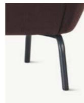
Black/White steel legs Standard