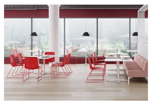
View image library