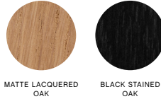
MATTE LACQUERED OAK