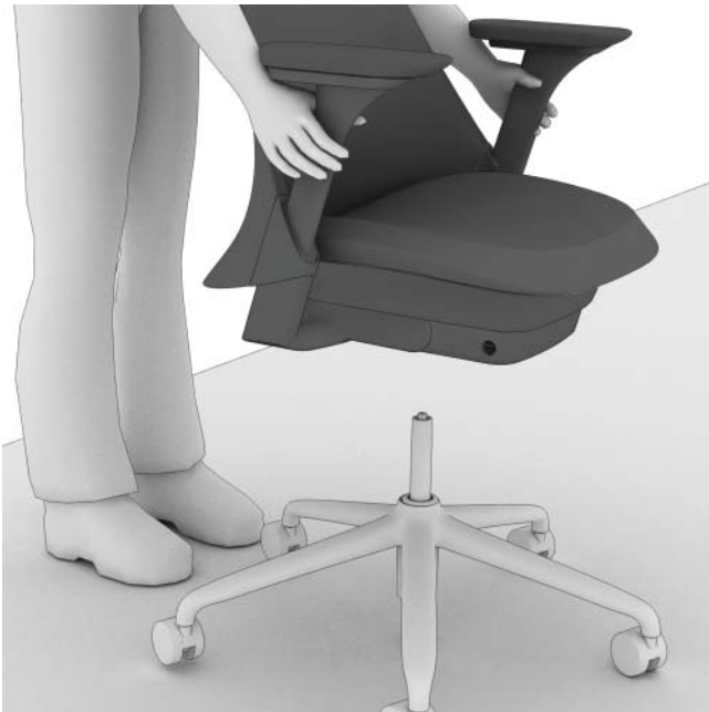
5. Extend chair arms in upright position grab the arm stems and lower Upper Chair Assembly onto top of cylinder.