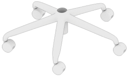
A 5-Star Base