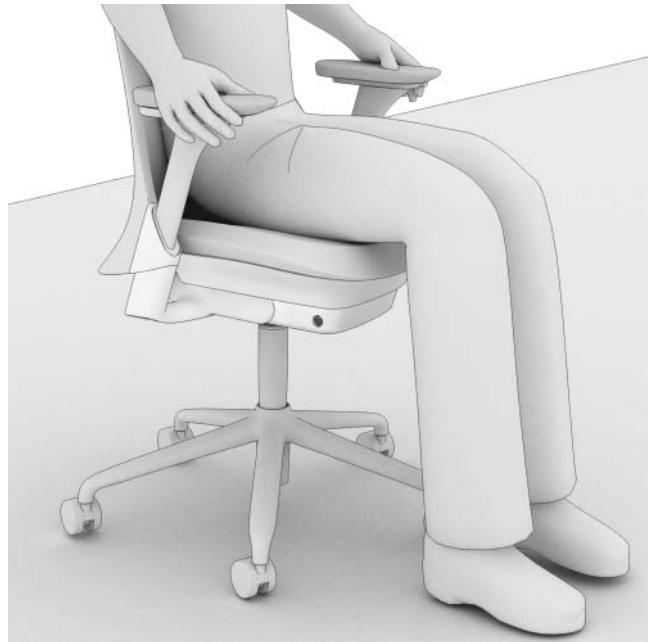
6. Sit on chair firmly several times to set cylinder and base.