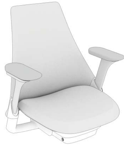
C Upper Chair Assembly